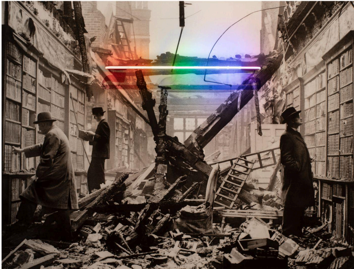
Image: Sarkis, Arc-en-ciel comme mesure n°5 , 2022, Fine art print fixed on aluminium, neon, 20 x 159 cm

Sarkis interweaves Eastern and Western intellectual traditions in his art, exploring themes of time, memory, and identity. His work for the exhibition includes a piece that transports viewers to a scene from the WWII bombing of London. Using lead and neon, Sarkis creates a luminous environment where reality and dream intertwine, reflecting on the resilience against war's destructiveness.