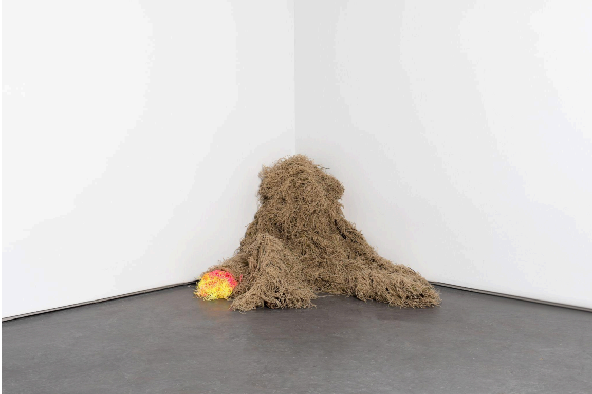
Image: Nasan Tur, The Invisibles , 2021, Polyester, metal sticks, 90 x 90 x 57 cm

Echoes of Conflict invites visitors to explore the relationship between art and the lasting impacts of war, offering a platform for reflection on how these themes continue to influence contemporary society. Each artist's work provides a unique lens through which to examine the interplay between visibility and invisibility, memory and oblivion, in the context of global conflict.