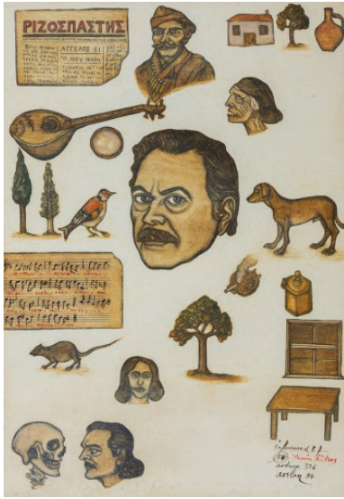
Arture 326, Influences (B)-54 (Y. Ritsos) 1984 Mixed media on paper 30 x 21 cm

Sui generis is a Latin phrase that means “of its/their own kind”, “in a class by itself”, therefore “unique”. Creative arts, for artistic works that go beyond conventional genre boundaries.